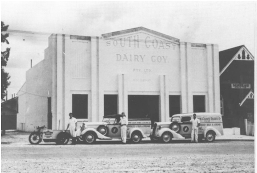
South Coast Dairy, 1936