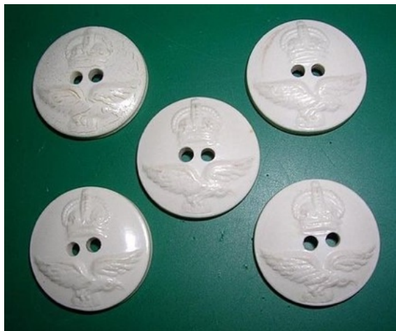
White galalith RAAF pre-1953 buttons made from casein.