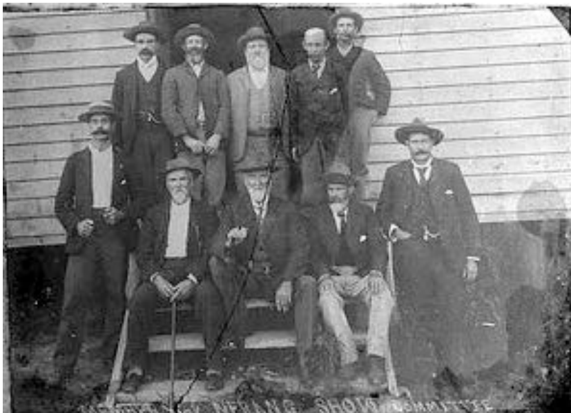
Members of the Nerang Show committee, circa 1909-1912. Do you know who any of these gentlemen are? Let us know