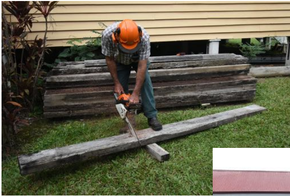
Around the Railway Station.