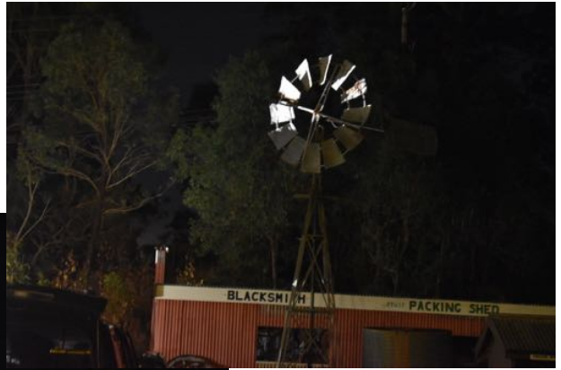
The Museum at night.