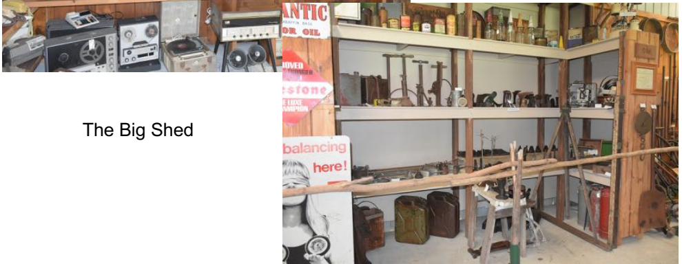
The Big Shed